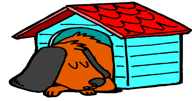
Places to rest you & your dogs...

Hound certification runs & practices will be offered after the completion of the trial on Saturday.