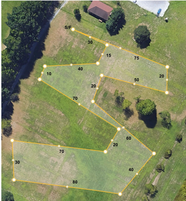
SATURDAY Course Plan 630 yards