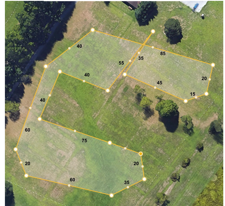
SUNDAY Course Plan 645 yards