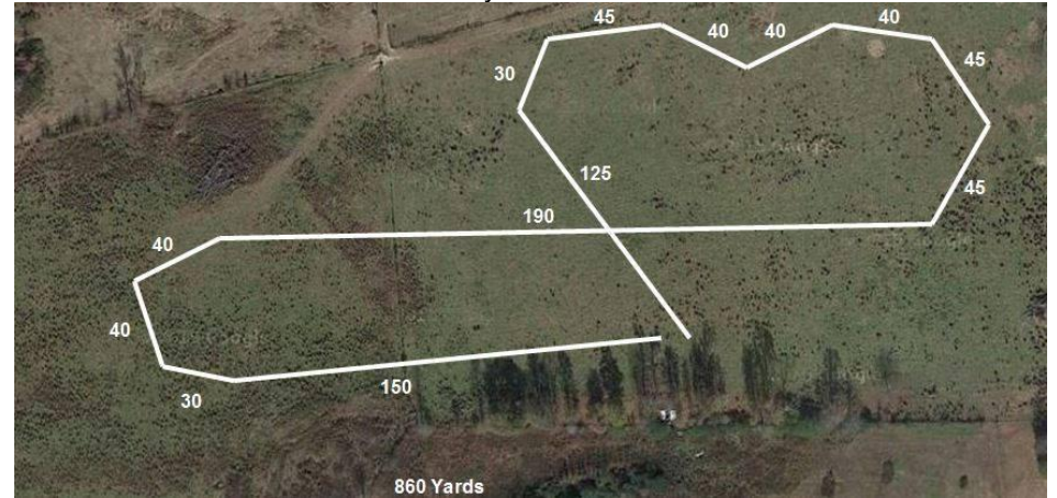
Sunday – 860 Yards

This county is serious about RABIES VACCINATIONS. Please bring your dog(s) Rabies Certificates and tag with you.